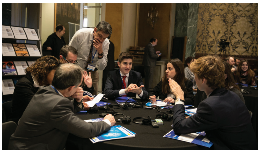
The Regional Forum also saw the project "Generation Entrepreneur" officially launched under the framework of the Mediterranean Initiative for Jobs (Med4Jobs).

The UfM Regional Forum brought together 500 Mediterranean key stakeholders , including Ministers, official delegations, civil society and private sector representatives, regional stakeholders, International financial institutions and socioeconomic project promoters. The Forum also saw the presence of the President of the Italian Senate in his capacity as President of the Parliamentary Assembly of the UfM, the Vice-President of the World Bank for the Mena region, the Vice-President of the European Investment Bank as well as other representatives of key institutions working in the euro-Mediterranean region.