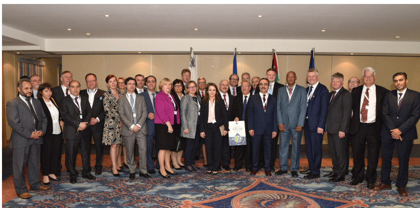
Ministers in charge of water from the UfM Member States gathered in Valetta (Malta) to develop a UfM Water Agenda to further enhance regional cooperation on water.