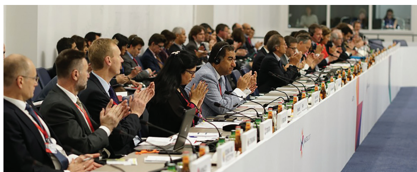
The Ministers called for the identification of innovative solutions to create more opportunities for youth, and thus help to address the current pressing challenges of the Mediterranean region.

– PRIMA . This new integrated initiative will contribute to pooling the know-how and financial resources of the European Union and participating Member States in order to foster ground-breaking solutions for sustainable water provision and management and food production in the Mediterranean region. 19 UfM countries are currently involved in it. The Ministers reiterated their support for the launch of PRIMA's first calls for proposals in early 2018, after the formal adoption of the decision by the European Parliament and the Council of the EU.