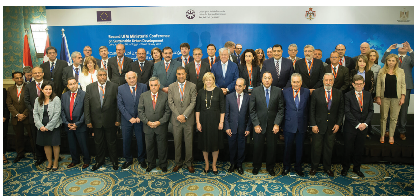
Ministers in charge of housing, municipal affairs and urban development gathered in Cairo to reinforce cooperation and adopted the UfM Urban Agenda.