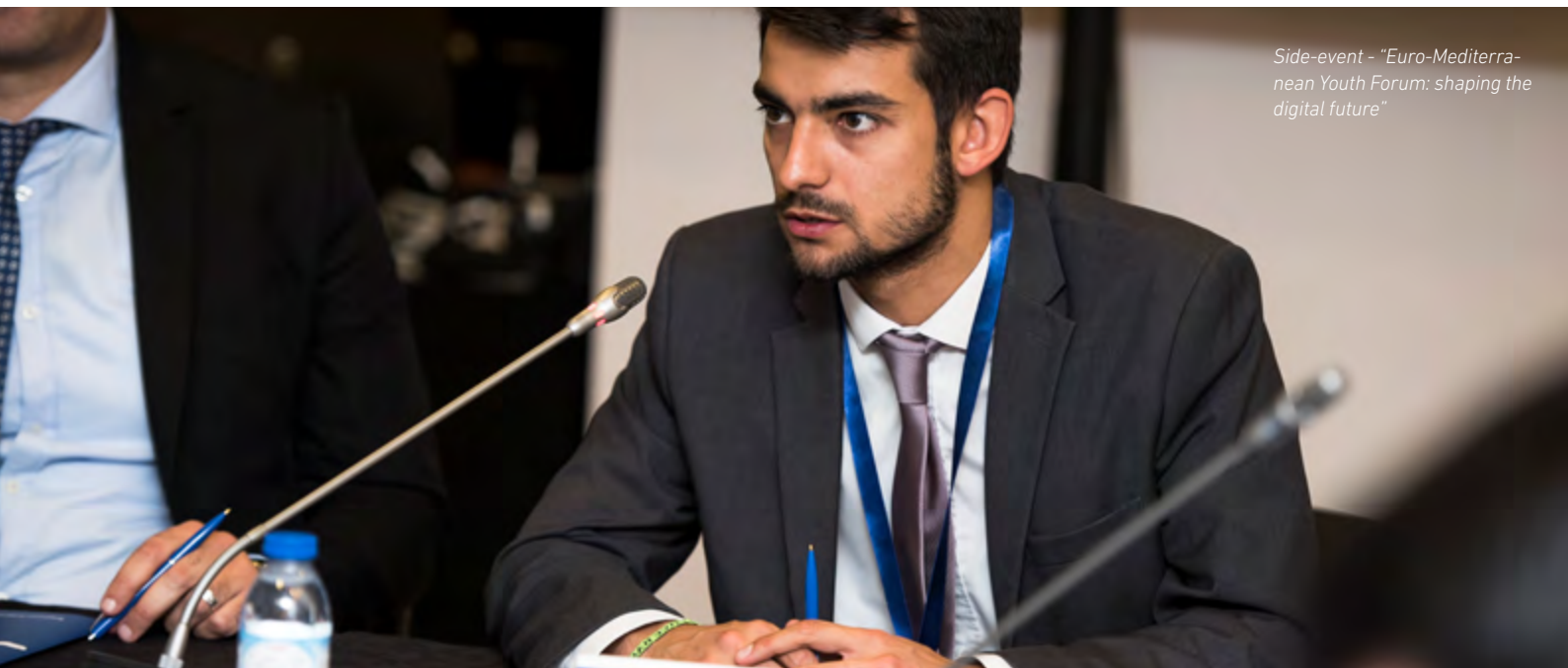
Side-event - "Euro-Mediterranean Youth Forum: shaping the digital future"