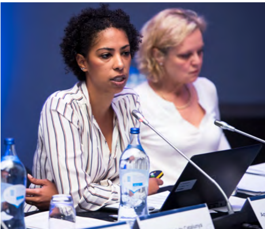
Side-event - "UfM Regional Dialogue on Women Empowerment"

vernments, parliaments, private sector, international organisations, civil society, academia, media, young women and men— to work together as a collective intelligence platform that discusses, generates ideas and solutions, exchanges experiences and identifies concrete actions toward advancing gender equality in UfM countries.