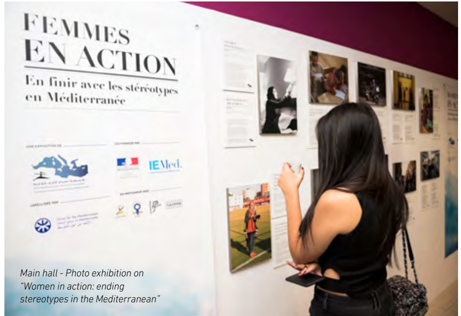
Main hall - Photo exhibition on "Women in action: ending stereotypes in the Mediterranean"

The Conference focuses on women's leadership as catalysts for change and as drivers of solutions to address regional challenges. It raises awareness about the untapped capacity and talents of women in the region and the need to overcome cultural and social barriers to drive actions for gender equality.