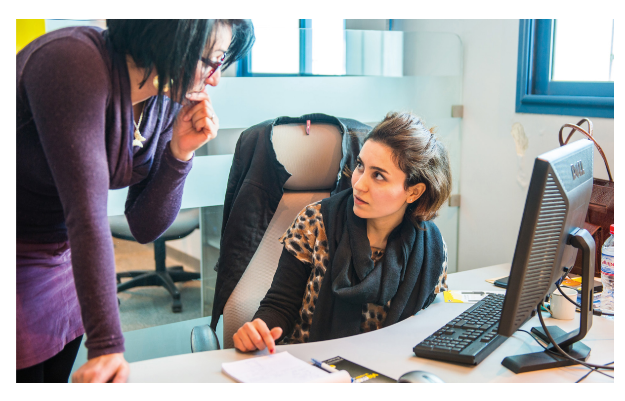
CEED GROW is helping women overcome the traditional obstacles they are faced with by offering business and financial management training.

HOMERe uses mobility internships as a tool to combat this skills gap. Through its network of academic institutions, the project aims to attract transnational private companies in the Mediterranean region that are searching for brilliant employees. The programme provides help in the identification, preparation and mentoring of appropriately qualified students, while the host companies commit to allocating a tutor to their interns and to pay them a monthly allowance. The internships last on average for 6 months.