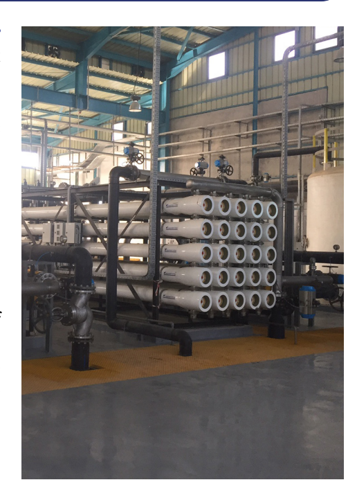
Desalination facilities of Gaza.

The project will help to address the major water deficit for a population of over 2 million people. It is also part of a broader Palestinian Water Programme in Gaza, which aims to address the water crisis on the Gaza Strip, where 95% of the water is undrinkable due to the over-pumping of the Coastal Aquifer, the only available water source in the region. Furthermore, it will help reduce the pollution of the Mediterranean, by preventing the collapse of the