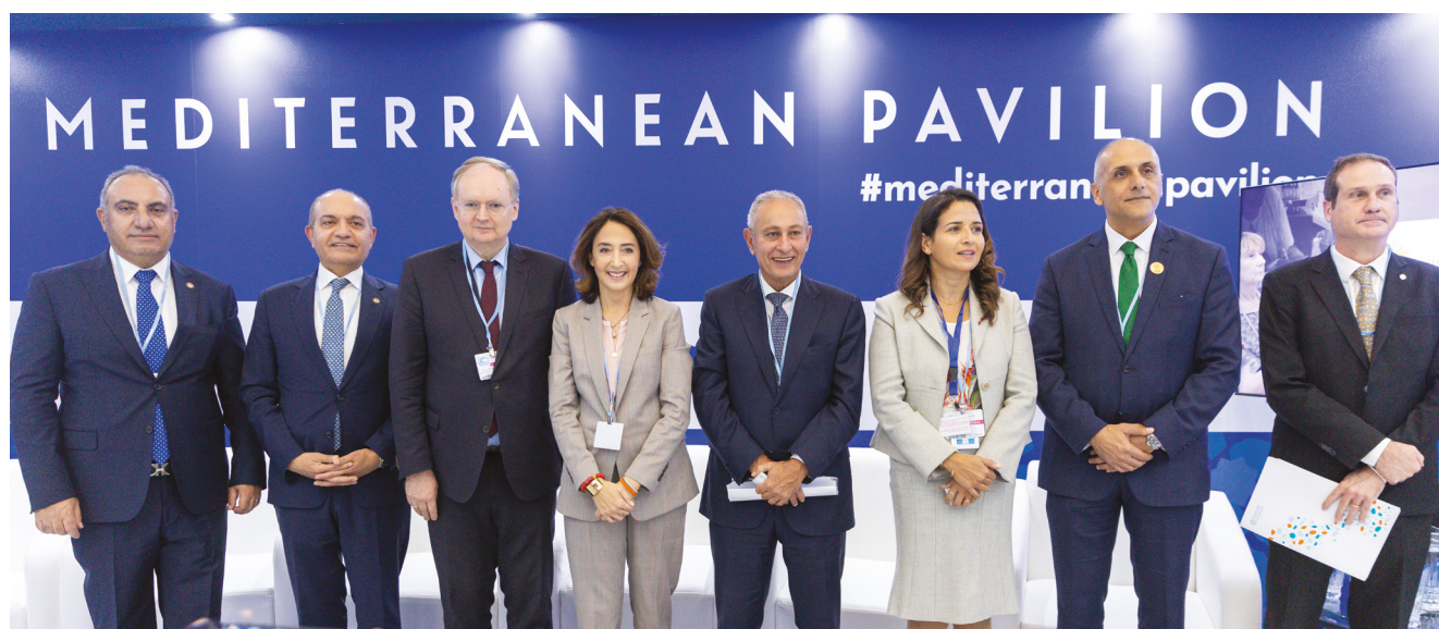
Opening of the Mediterranean Pavilion in the 27 th edition of the Conference of the Parties' (COP).