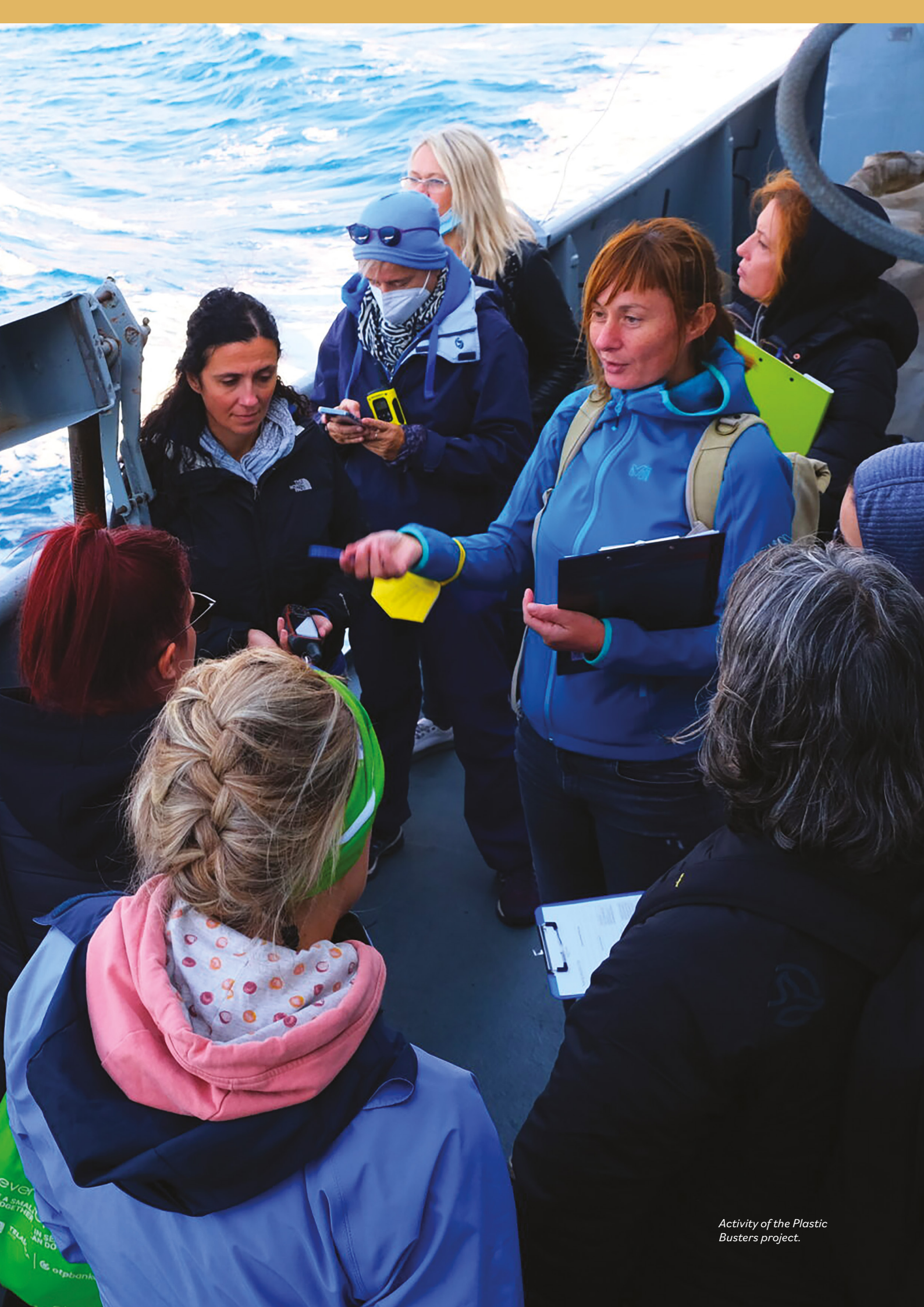
Activity of the Plastic Busters project.