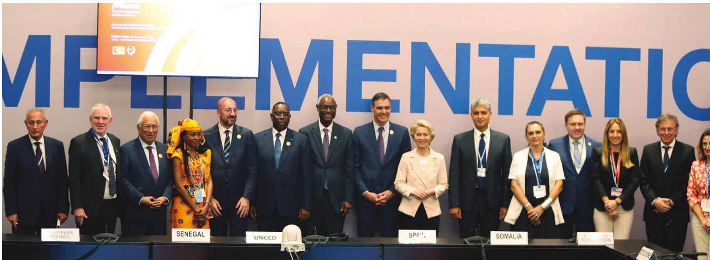
Launch of International Drought Resilience Alliance.