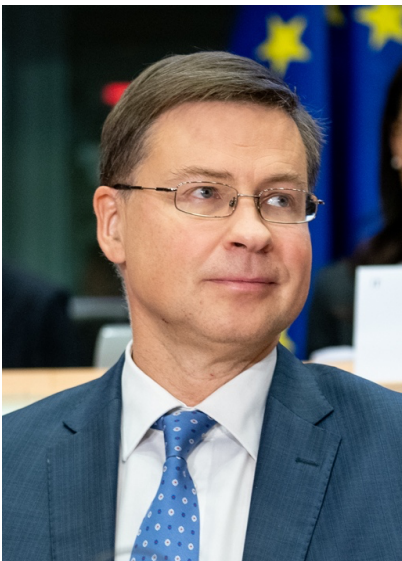
H.E Valdis Dombrovskis Executive Vice-President and Commissioner for Trade An Economy that Works for People European Commission