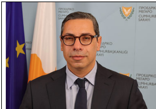
H.E. Costantinos Kombos, Minister of Foreign Affairs, Republic of Cyprus

Dr. Constantinos Kombos was born in 1976 in Lemesos. He has studied Law and holds a postgraduate degree in EU Law (LLM University of Cambridge) as well as a PhD in European Constitutional Law (PhD University of Hull). He was elected at the Department of Law of the University of Cyprus in 2006, of which he is a founding member. He has served as chairman of the Law Department and as a member of the Senate. He has published 6 books and numerous articles and chapters in scientific magazines and collective volumes. Part of his work has been translated and published in 6 languages. He has also participated in and delivered speeches at numerous international conferences.