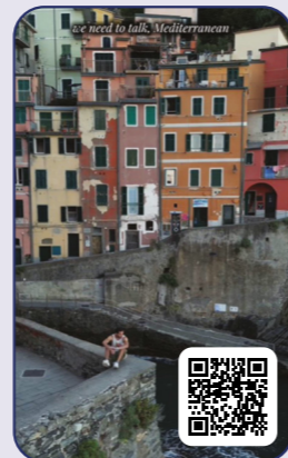
Brian Federico Rocca (Italy)